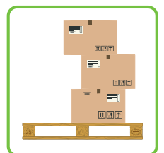
An incorrectly loaded pallet