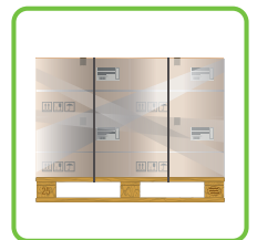
A correctly loaded pallet